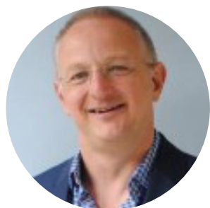
JEREMY PARR, Clinician Scientist in Pediatric Neurodisability, UK

autistic adult. Gaps focus on the need for, (1) more social supports, especially for elderly parents with adult children on the spectrum, (2) more community-based residential solutions, (3) an increase in social advocacy to support individuals and guardians, (4) help and support with life-course decisions, (5) consideration of the extreme heterogeneity in aging trajectories across the spectrum, and (6) the critical importance of involving individuals on the spectrum into the design and methodological aspects of research. A conceptual bioecological model was proposed for consideration (see Appendix 3).