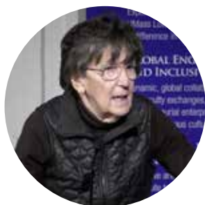
MARGARET BAUMAN, Pediatric Neurologist, US

Challenges identified include, (1) recruiting sufficient numbers of older adults on the spectrum who represent all levels of function and ability, (2) defining subgroups that may be at risk for accelerated aging or have protective factors/strategies, (3) developing more appropriate measure for quality of life, and (4) building on lessons learned and best practices in other fields, especially gerontology.