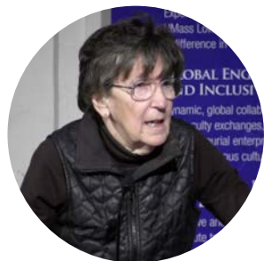
MARGARET BAUMAN, Pediatric Neurologist, US

in leading to more meaningful outcomes. The team has developed many best practice approaches on how to successfully engage individuals on the spectrum and their families in research projects, including ways to reach people on the entire spectrum through family members or innovative, tailor-made strategies. Key factors used to help establish meaningful participation in an integrated research program include, (1) relying on various communication methods (online vs. paper, visual vs. aural), (2) using different types of written materials (font size, spacing, colours, easy read formats), (3) tailoring meetings in autism-friendly environments (natural light, personalized meals, quiet space), and (4) making accommodations for autistic preferences and behaviour traits. An invitation to explore international collaborations was extended to Think Tank participants.